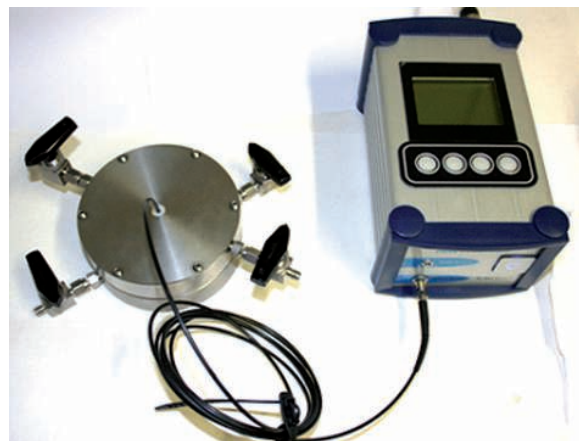
Fig. 1: Measurement system set-up: The new measurement cell with two gas connectors for each of the two chambers; the sensor spot is applied to the upper chamber and read out via polymer optical fiber by the Fibox 3 LCD trace.

A series of 16 measurement cells with different volumes were used in these experiments. The materials that should be tested for their barrier properties - film samples - were fixed between the upper and lower chamber of the measurement cell. Each chamber had two gas connectors, so first both chambers could be flushed with nitrogen (zero value). Then the lower chamber was flushed with oxygen.