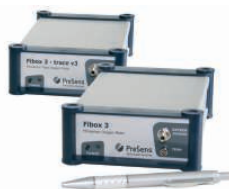
Fibox 3/Fibox 3 trace Fiber optic oxygen transmitter