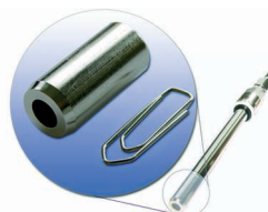
Oxygen Exchange Cap OEC is designed for easy exchange.