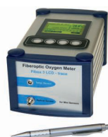
Fibox 3 LCD/Fibox 3 LCD trace Fiber optic oxygen transmitter with LCD display