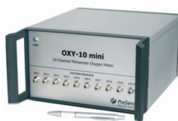
OXY-10 mini/OXY-10 trace 10-channel fiber optic oxygen transmitter