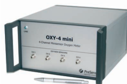
OXY-4 mini/OXY-4 trace 4-channel fiber optic oxygen transmitter