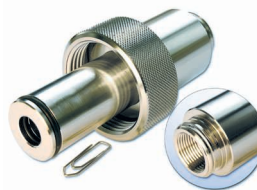
OAD-25, Adapter for 25 mm Ports The OAD-25 is used to connect all OIMs to 25 mm ports.

Technical data can change without prior notice.