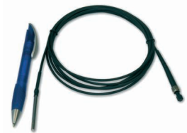
Dipping Probe CO 2 The solution for invasive measurements and monitoring.