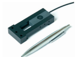
Accessories A variety of accessories like connectors to different vessels is available.

A wide variety of sensors is offered. If your application is missing, please contact us!