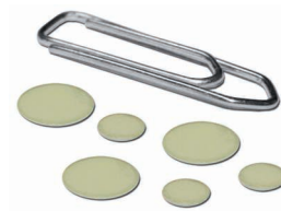
Sensor Spots CO 2 The most versatile version of carbon dioxide sensors.