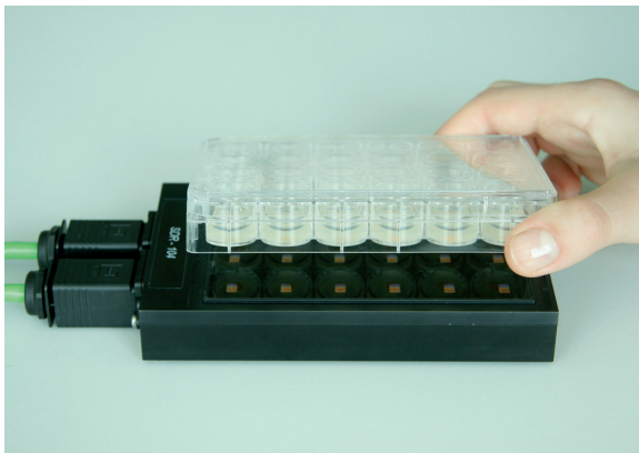
Fig. 1 The new SensorDish® Reader for non-invasive online monitoring of oxygen in cell cultures.

The effect of three different pre-treated collagen matrices on the oxygen metabolism of chondrocytes from porcine rib was investigated in parallel to characterise the optimal growth matrix (Giere, 2005). The SensorDish® Reader (Fig. 1) was used to obtain detailed insights into oxygen consumption and therefore the metabolic activity during cell growth, and to draw first conclusions on the suitability of the three matrices as growth substrate.