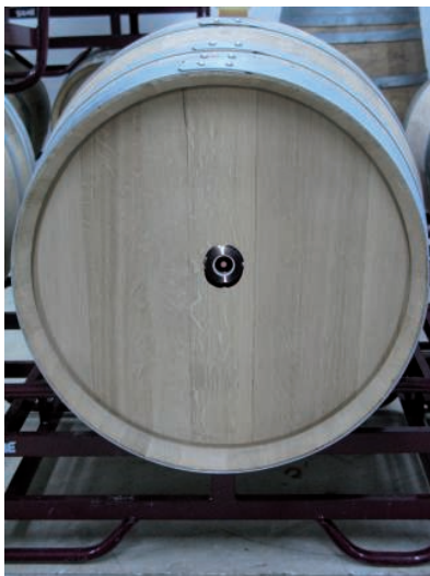
Fig. 3: PSt6 spot placed in a sight glass window in a barrel

The device allows to monitor the natural micro-oxygenation of red wine (Fig. 4), specifically the evolution of DO during its storage in barrels. It is noted that the amount of oxygen is highest in wine aged in French oak barrel, followed by American oak and finally Spanish oak. This trend is not maintained during the aging, because, as shown in Fig. 4 from the 25 days of permanence in barrels, the DO levels present in the wine are very similar to the three barrels, with values very close to 20 ppb.