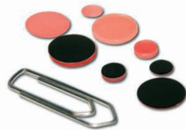
Fig. 1a: Sensor spots are the most versatile version of non-invasive oxygen sensors. They are attached to the inner surface of any transparent vessel.

A breakthrough was brought about with a new equipment by PreSens GmbH that uses the very same measurement system but with a completely different approach. It is based on the brilliant idea of splitting up the sensor element and the rest of the equipment making the best use of the optical measurement systems. This solution enables to measure non-invasively and at reduced costs of those processes that do not need constant monitoring. It was possible to implement the use of PSt6 foils in wine aging systems with quite interesting results. The change from the traditional electrochemistry and luminescent systems to the new DO measurement system was fulfilled.