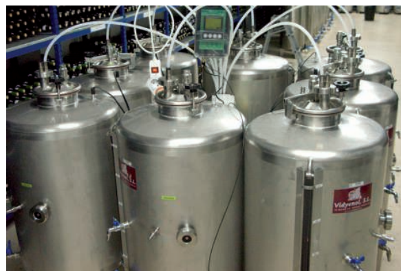
Fig. 2 Monitoring red wine in tanks during the MOX process.

The measurements were taken in red wines during periods of a few days up to a 12 month period. A Fibox 3 LCD trace model was chosen to detect DO traces as it is portable and able to collect these data without a PC. Flat stainless sight glasses were adapted in storage systems used, barrels and tanks, to introduce the necessary spots to monitor DO. Flat stainless steel (AISI 316L) sight glass (DIN 11850 DN25) was used.