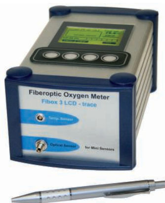
Fig. 1 The Fibox 3 LCD is a fiber optic oxygen transmitter with LCD display.

Micro-oxygenation processes happening while storing wine in barrels give quality red wines the necessary final trait. Dissolved oxygen (DO) levels reached during the usual storage months are so low that measurement systems requirements become very high. There are measurement systems with detection limits at ppb ( \mu\text{g/L} ) based on electrochemical probes but they consume oxygen during the measuring process which is a problem as carrying out a dynamic measurement, i. e. in a fluid in motion, becomes necessary. Measurement of DO in wine flow has several disadvantages that can be solved but at the expenses of time and money. The optical measurement system Fibox 3 LCD trace allows to deal with the need of measurement in systems with low volume, at different atmospheric pressures, and the advantage of carrying it out in an inerted way.